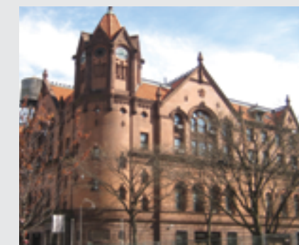
The Harlem Community Justice Center, one of our outreach partners.