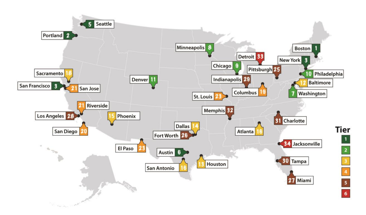
Figure ES-2: City Rankings in the 2013 City Energy Efficiency Scorecard

Figure ES-2 shows how cities ranked in the City Scorecard , dividing them into six tiers of similarly scoring cities. The policy-area-specific scores on which these overall scores were based are detailed in Table ES-1. The cities in each tier varied with regard to the policy areas in which they scored poorly or well, but in general they are at a similar level overall in the development of their actions on energy efficiency. In many ways the differences among individual cities, and particularly the fractions of points that separate many of them, are less important than the differences among these tiers.