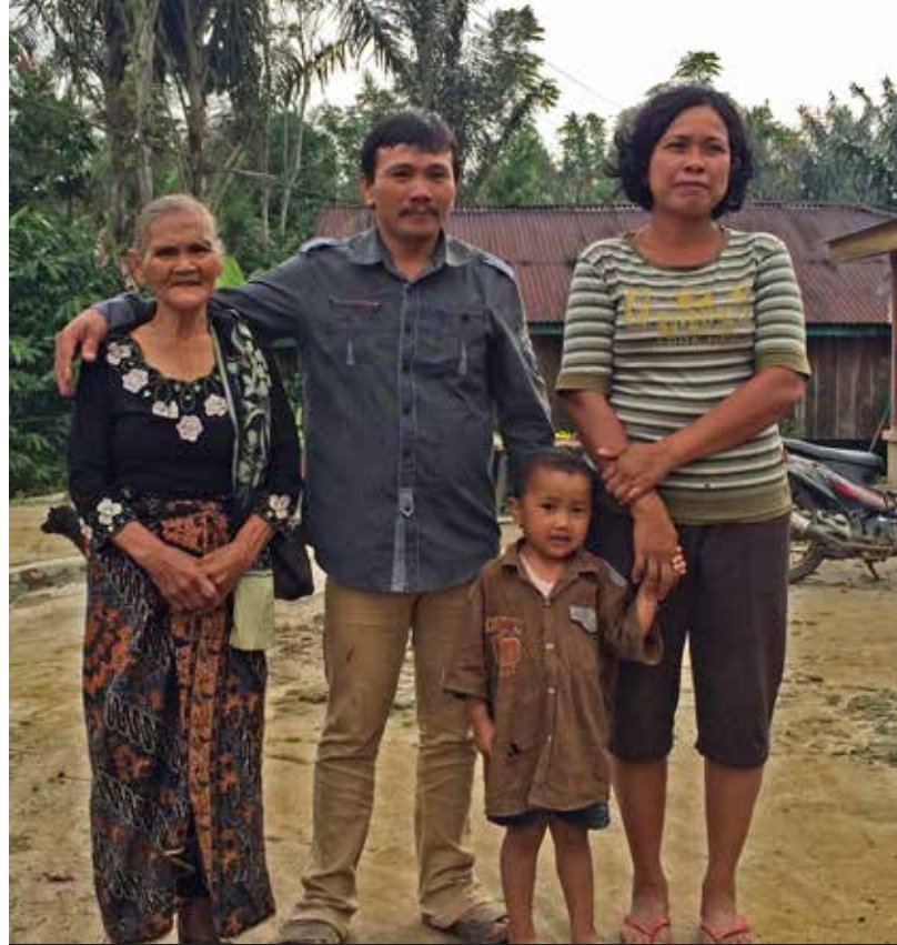
THREE GENERATIONS OF AN INDIGENOUS TANO BATAK FAMILY FROM THE NEAR BY VILLAGE OF NAGAHULAMBO, WHO HAVE ALSO BEEN FIGHTING TOBA PULP LESTARI'S INCURSION INTO THEIR LAND.

Currently, the community of Pandumaan-Sipituhuta and TPL are at a standoff. TPL has said they do not intend to cut down more of the benzoin forest owned by the community--but they have not documented that commitment, and hundreds of hectares of community lands have been planted in eucalyptus plantations where the company and government are refusing to recognize collective community rights over the area and excise it from the concession. The community is demanding that the government recognize their legal rights to their lands and to their benzoin forests and that TPL excise their lands from the concession.