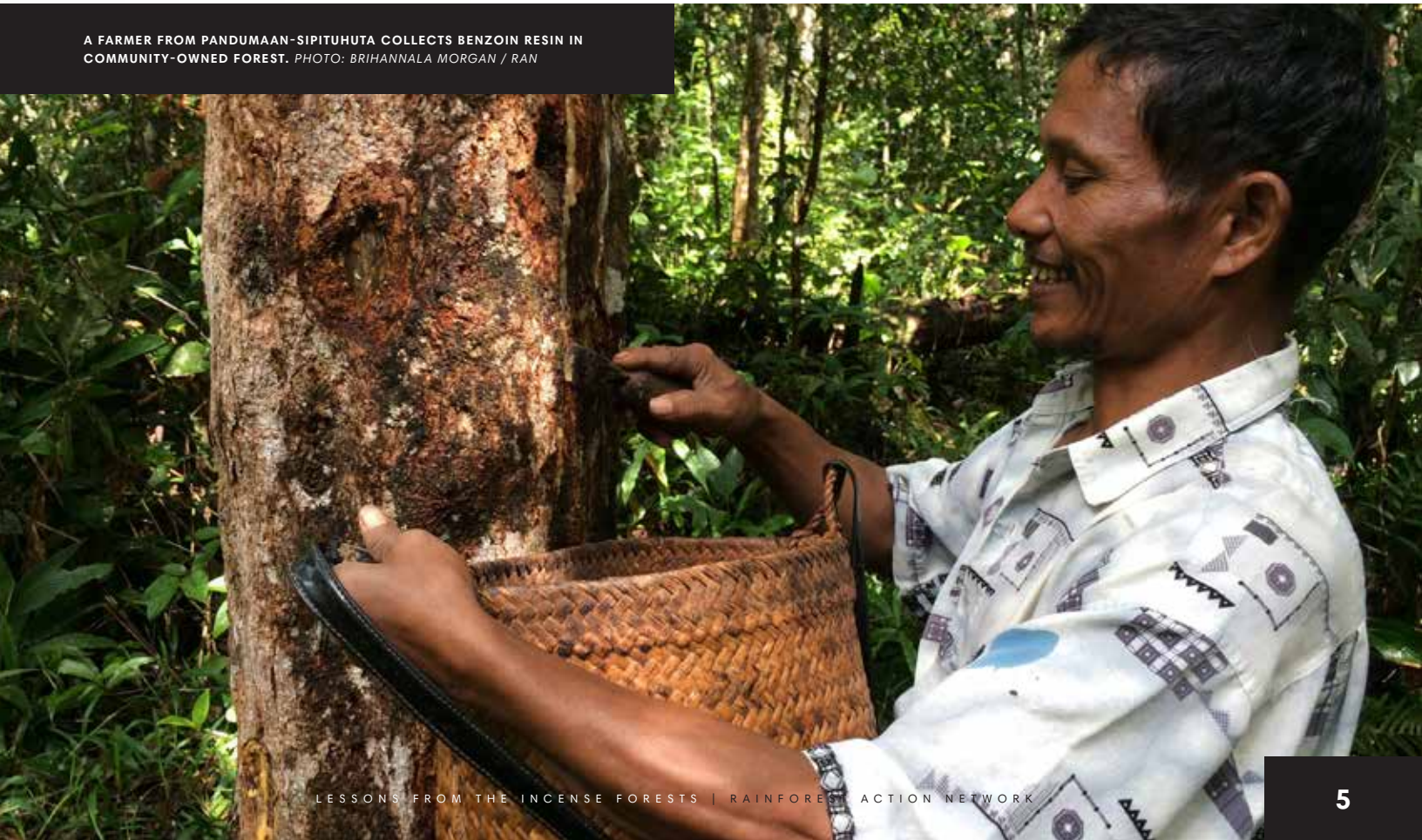
A FARMER FROM PANDUMAAN-SIPITUHUTA COLLECTS BENZOIN RESIN IN COMMUNITY-OWNED FOREST.

The community has also been actively engaging in protest. After four years of resistance that included intimidation by the police mobile brigade and a number of arrests, the situation in Pandumaan-Sipituhuta escalated dramatically when, in early 2013, TPL employees were discovered cutting down the benzoin trees. Roughly 250 residents came out to protest where the forests were being cleared. They took the chainsaws that the TPL employees were using to clear the forest and brought them back to the village. Toba Pulp Lestari again called in the police mobile brigade, which arrived in the middle of the night and--threatening the community with rifles--searched through the houses of sleeping families. Local people were beaten with truncheons and elderly community members were assaulted. The police arrested 31 farmers. The police later released 15 of