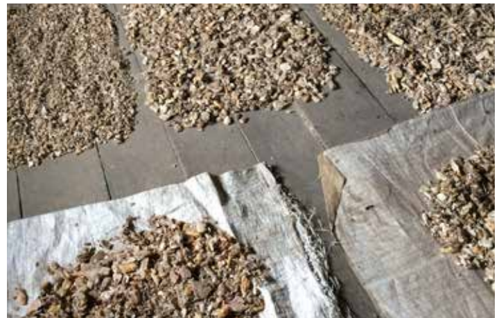
CLOCKWISE FROM ABOVE: COMMUNITY ACTIVISTS IN PANDUMAAN-SIPITUHUTA RECEIVE SIGNATURES OF SUPPORT FROM RAINFOREST ACTION NETWORK SUPPORTERS; ORCHID FOUND IN THE COMMUNITY-OWNED BENZOIN FOREST; DRIED BENZOIN RESIN READY FOR SALE.