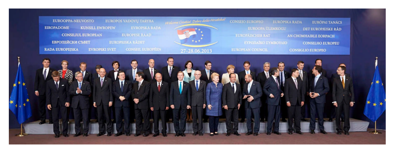
The EU leaders at the European Council meeting on 27-28 June 2013 in Brussels endorsed a comprehensive plan to combat youth unemployment.

unemployment and poverty. The cost of doing nothing is therefore very high: the Youth Guarantee scheme is an investment. For the Commission, this is crucial expenditure for the EU to preserve its future growth potential. Significant EU financial support can help — most notably from the European Social Fund and in the context of the Youth Employment Initiative. But to make the Youth Guarantee a reality, Member States also need to prioritise youth employment measures in their national budgets.