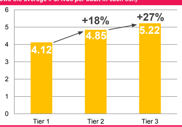
Figure 1: Average number of NCs per audit per tier from the sample of 10 companies (shows the average # of NCs per audit in each tier.)

By taking a multi-tiered approach, the ten companies included in our sample achieve greater engagement with their suppliers and better insight to more effectively understand, monitor and tackle risks head on.