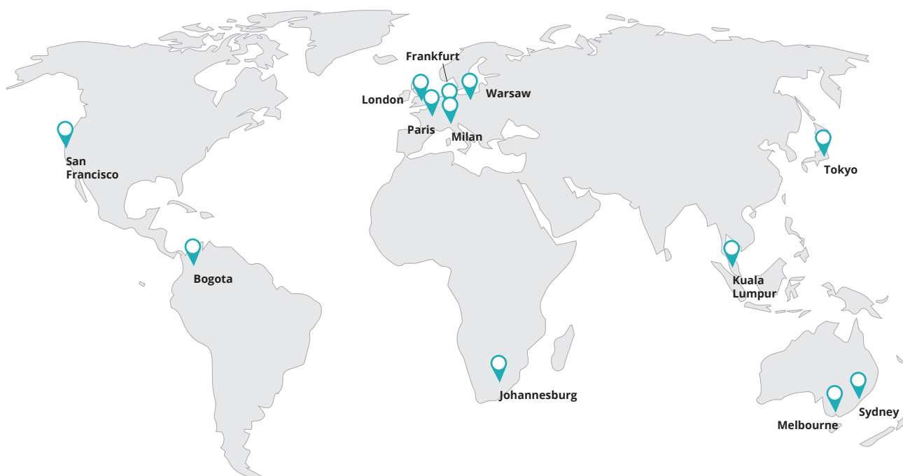
Figure 3: Map showing the location of each of the roundtables.

Between April and June 2019, the Participants and other associated organisations convened 13 roundtables in 12 cities across six continents, as shown in Figure 3.