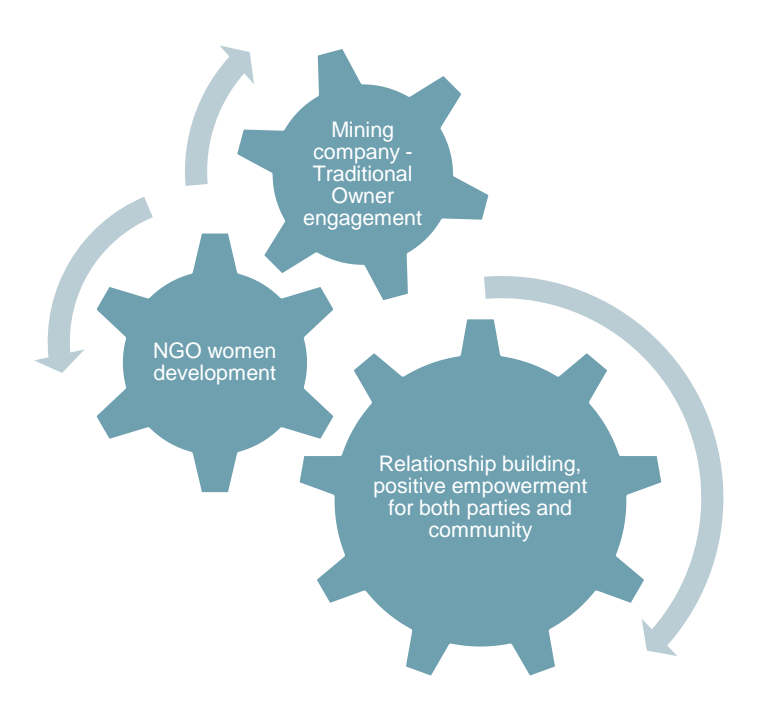
Figure 4. Example of an integrative partnership at stage 3.

Partnerships at stage 3 included the integration of an Indigenous capacity building project into a company's procurement and employment strategy, and a women's empowerment program incorporated into a company's community engagement strategy (see figure 4). Here, the objectives were almost completely aligned, and the roles each party played were integral to the outcomes of the partnership, such that a power balance was achieved. Success depended on each party upholding their commitments, and risks, resources and rewards being shared.